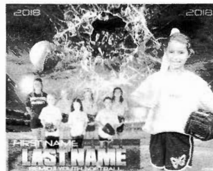
Graphic Memory Mate Team & Individual on 8x10 Print