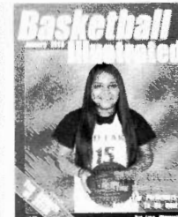
Magazine Cover Shot 8x10 Print